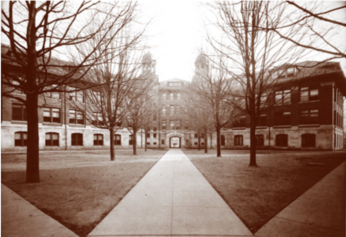
The New Engineering Building - 1903